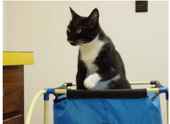
You can't get to me here, guys! At last! A bath and nap in peace!

Don't get me wrong! These people are great, and my kittens and I were lucky to have found them when we needed them most. I wasn't in great shape, homeless and had six mouths to feed..... Cadbury, Willy Wonka, Half Moon, Oreo, Milk Dud and Hershey. We were soon well fed and cared for. I'm a pretty good mama, if I say so myself, so with a little extra help from the HSSC, I soon had my babies healthy and big enough to be eating on their own so that they could move into a foster home until adopted.