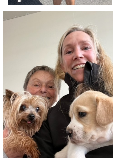
Arrival in Elmira after a bumpy, windy ride.