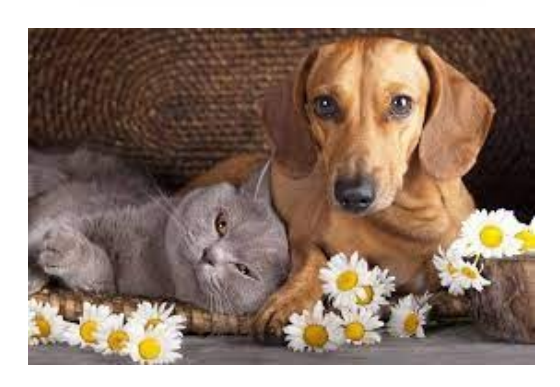
May, 2023 Newsletter